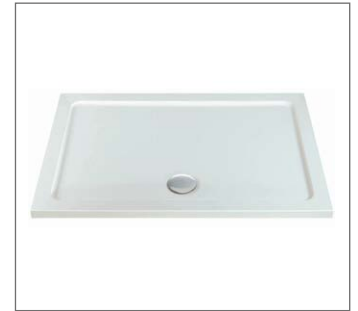
Waste not included