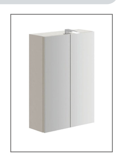
MI190 MI191 MI192 MI193 MI194 MI195