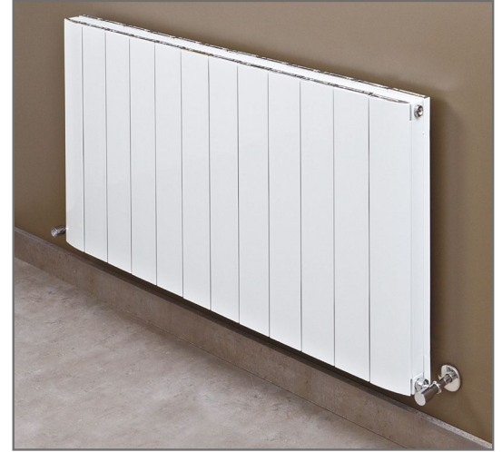
600 x 1124 Image Shown

Range: Radiators Type: Urban Code: RA232 RA236 Version/Date: v3 01/19