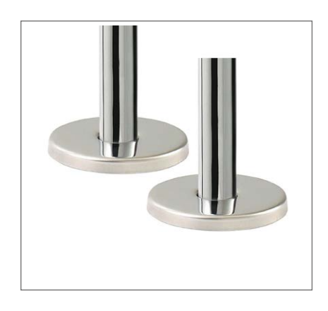
180mm long 15mm Water Pipes & Base Shrouds